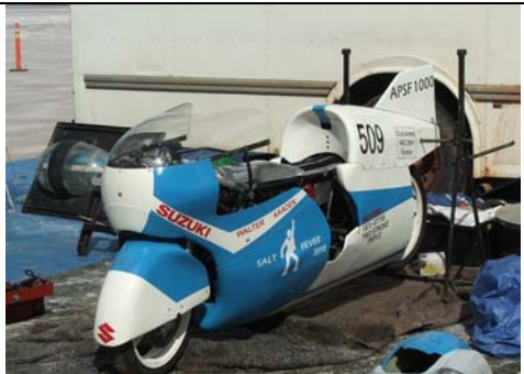
509 Brett DeStoop