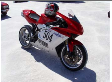
504 Malcolm Sturrock