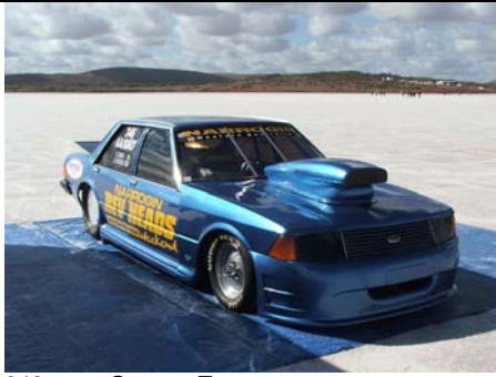
346 Graeme Turner