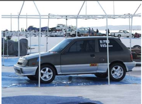
445 Rebeka Tucker