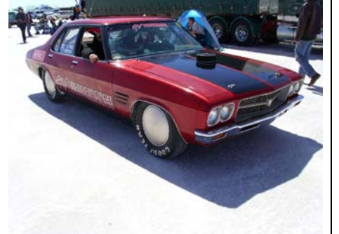
892 Tobias Breen