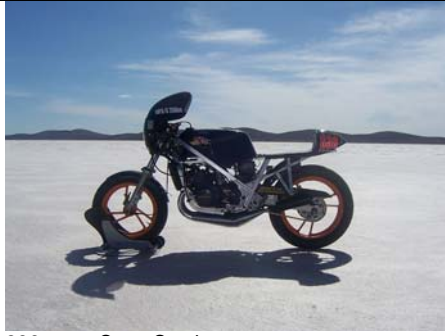
836 Sean Steck