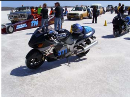
371 Grant Schlein