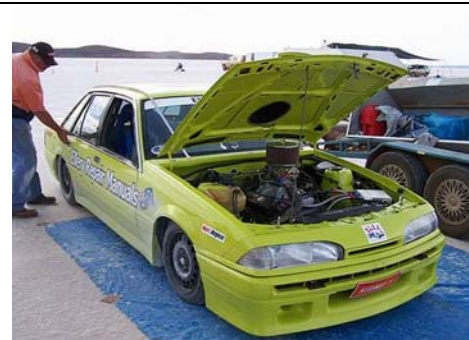
510 Max Ellery