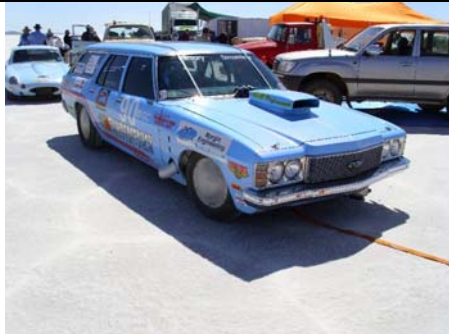
3 Rod Hadfield