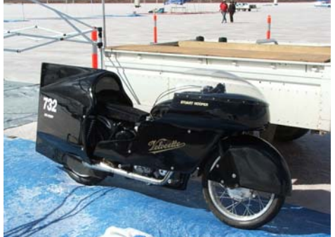
732 Stuart Hooper