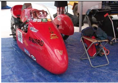
280 Terry Prince