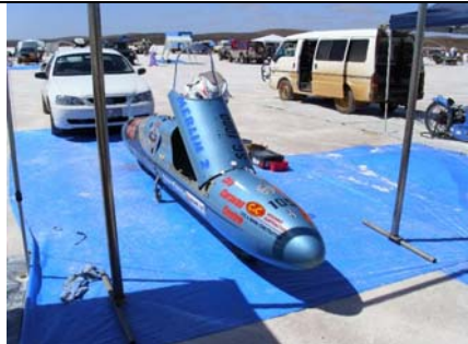
105 Lucky Keizer