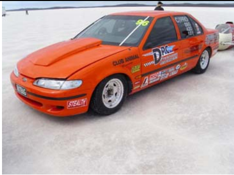
390 Daryl Chalmers