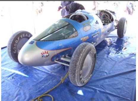
423 Alan Fountain