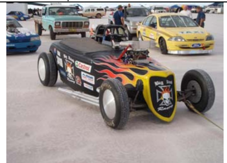
201 Norm Harding