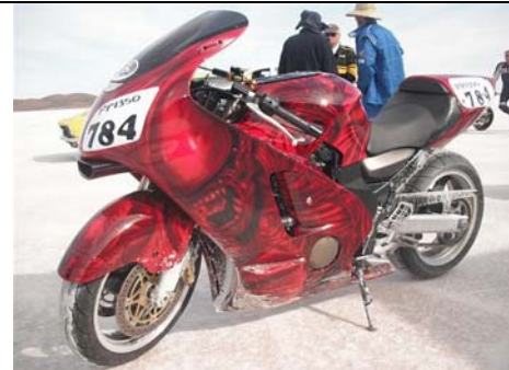
784 Peter Code