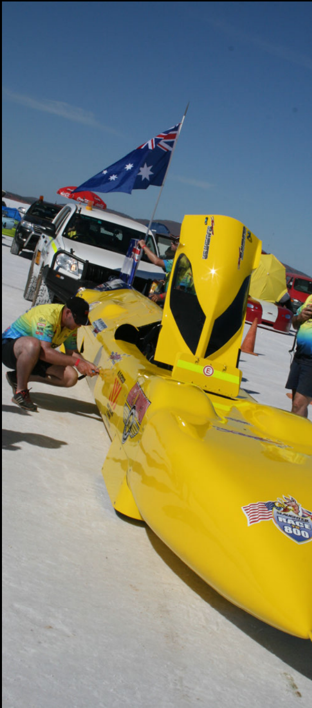
Trevor Slaughter's Streamliner – 458 mph is the goal!