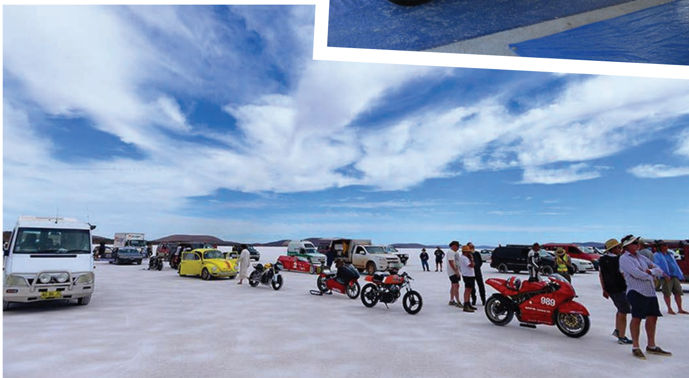
ABOVE: Vehicles at start line on track 1.