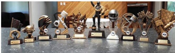
Ranger's Choice - Not presented this year Sponsored by D.L.R.A.