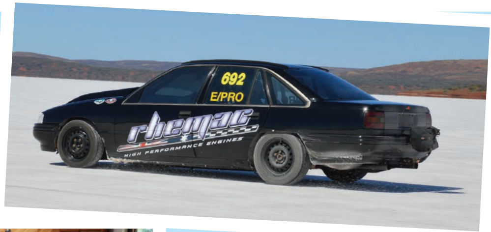
RIGHT: Best Presented Car - Tharon Hart #692 Sponsored by Cambridge Motorsport