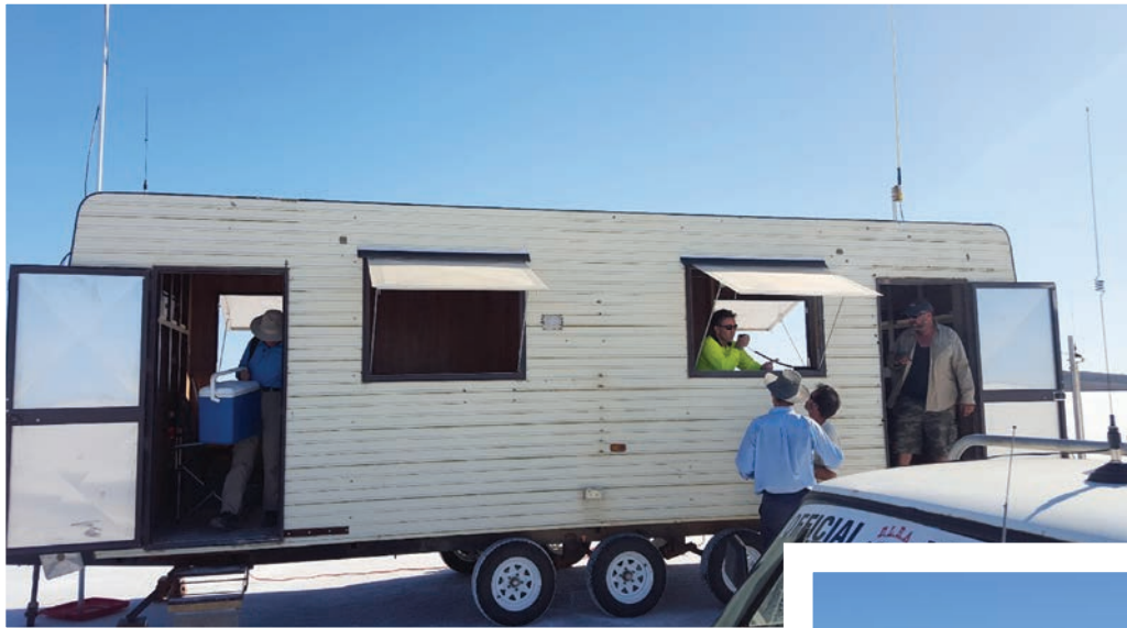
LEFT: New timing van was a vast improvement.