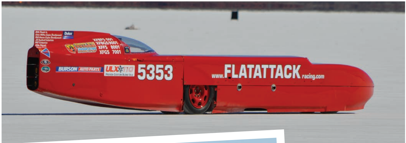
ABOVE: Best Presented Crew - Flat Attack Sponsored by Blue Mountains Custom Metalcraft