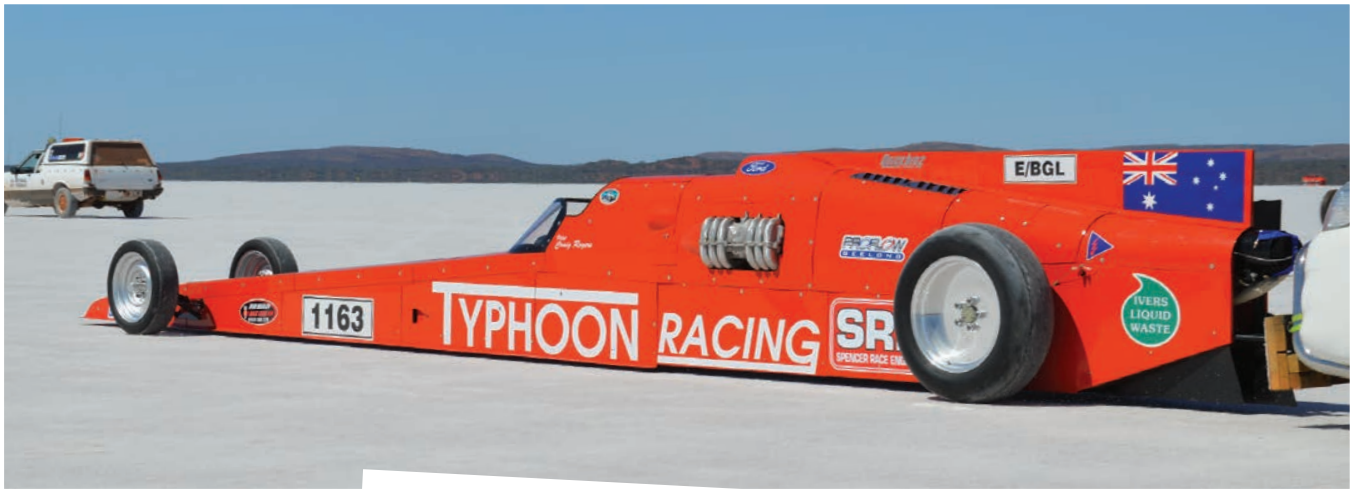
ABOVE: Race Director's Pick - Craig Rogers #1163 Sponsored by Bullet Supercharging