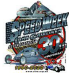
Metal Signs $45.00