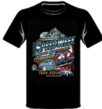
T-shirt, Black $36 Mens - S to 5XL Ladies - 10 to 18