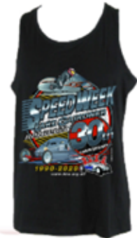
Singlets, Black $20 Mens - S-XL Ladies - 12-16