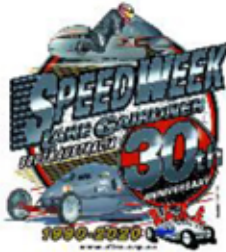
2020 Stickers $2.00