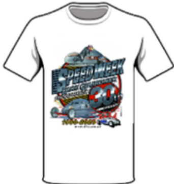
T-shirt, White $36 Mens - S to 5XL Ladies - 10 to 18