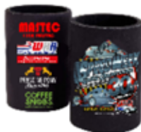
Stubbie Holders $12.00