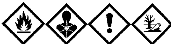
Flame Health Hazard Irritant Aquatic Hazard